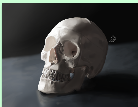
Loyal Singh 12I