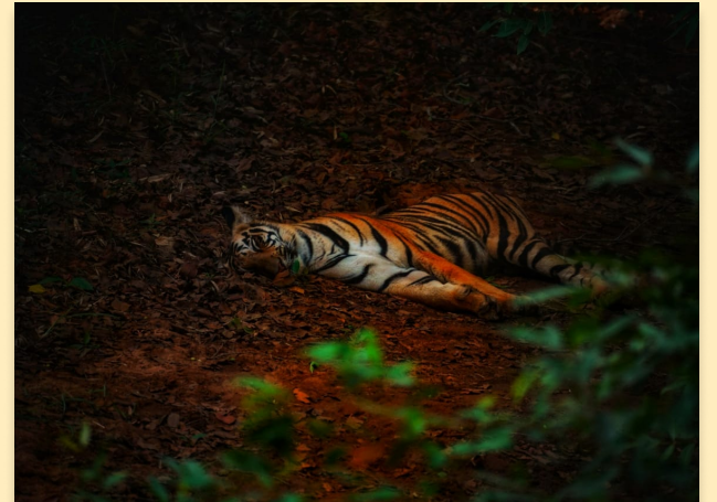
Shreyam Bej 12A