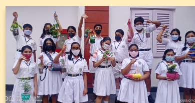
VERTICAL GARDENING Go green and go pretty!