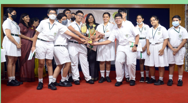
PRAGYA A spectacular war of wisdom that celebrates the beauty and importance of Hindi in day-to-day expressions.