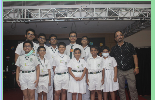
QUIZATHON A test of wits that brought together the entire school!