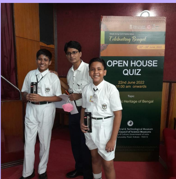
BITM QUIZ To know one's heritage acts as the perfect give and take of pride and love.