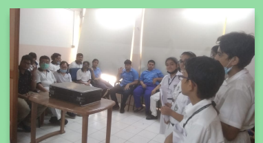
MANOVIKAS KENDRA A step towards Inclusive Education!