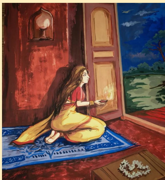
Aditi Uttam 11P