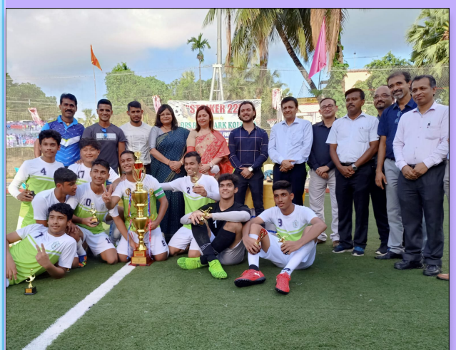
STRIKER The spirit of teamwork makes a goal more fruitful than ever!