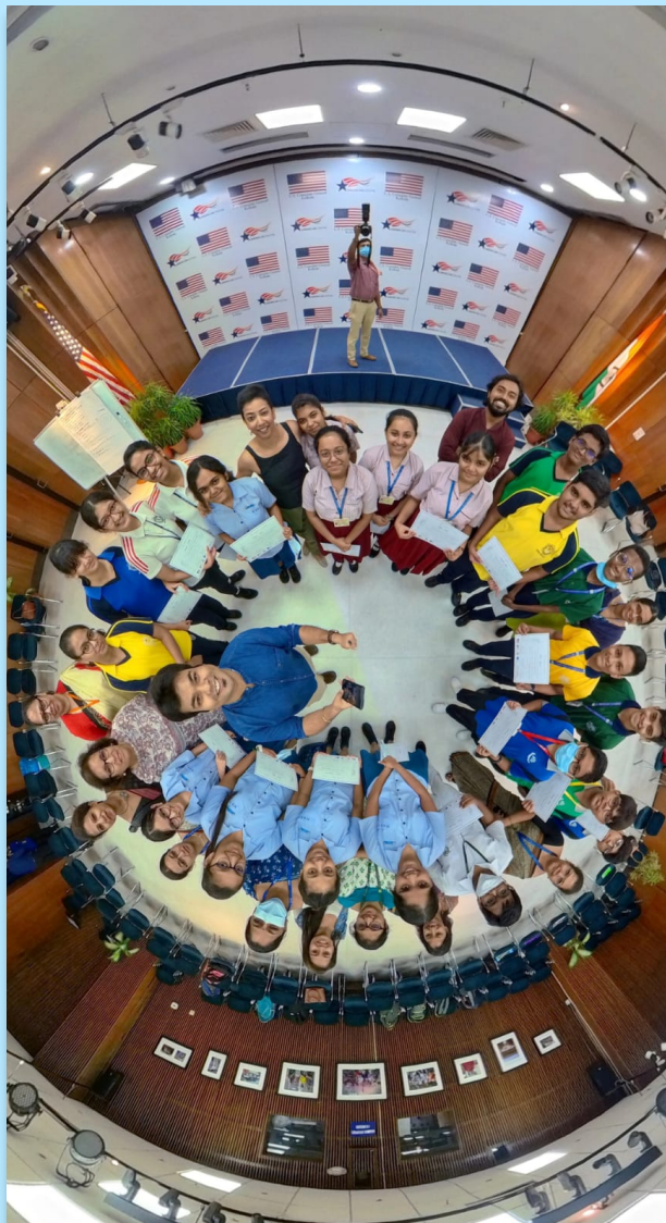
WORKSHOP AT AMERICAN CENTRE It's all about the mind's perspective!